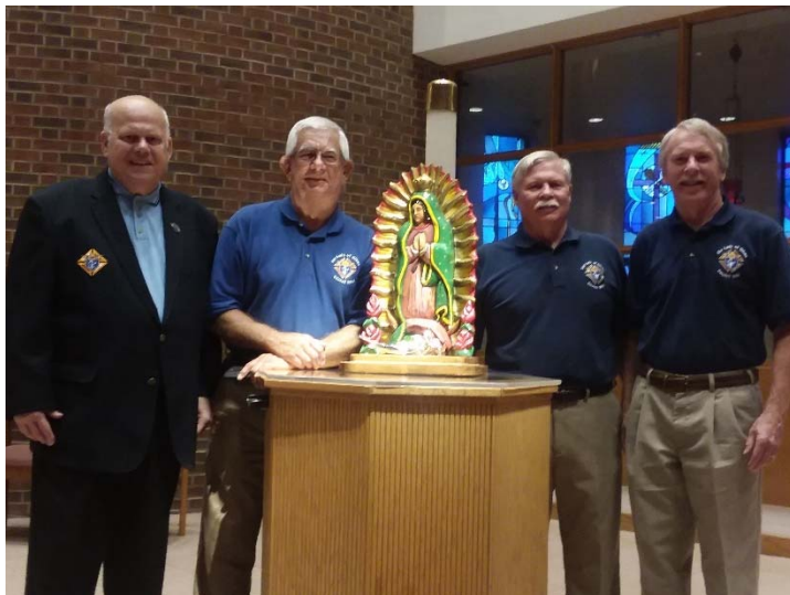
Left: Our Lady of Guadalupe and the Silver Rose