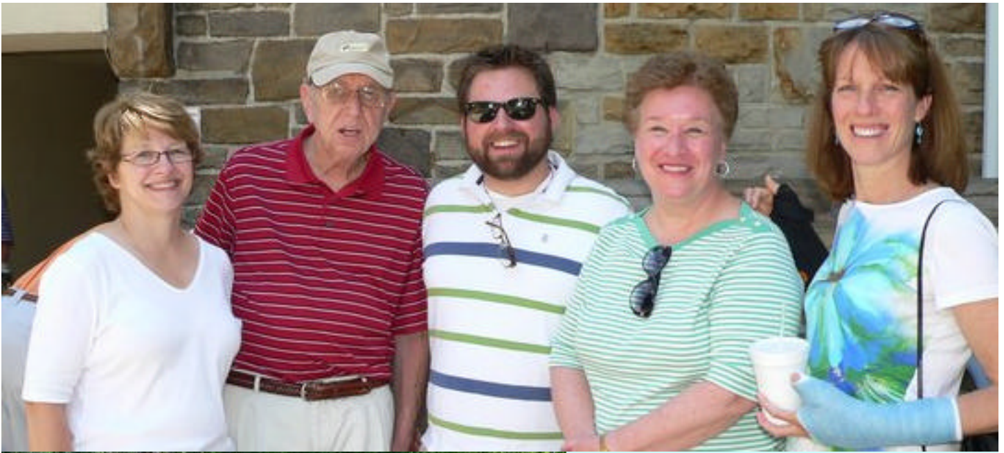
2012 SJN Golf Outing